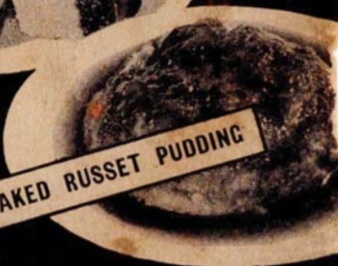
BAKED RUSSET PUDDING