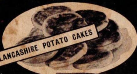
LANCASHIRE POTATO CAKES