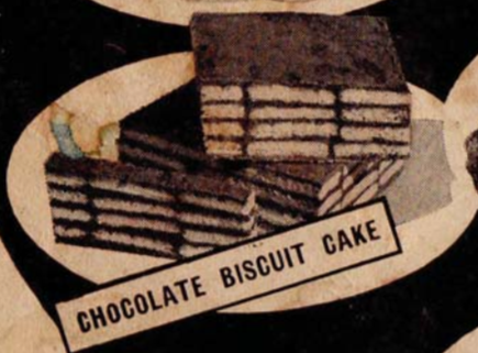
CHOCOLATE BISCUIT CAKE